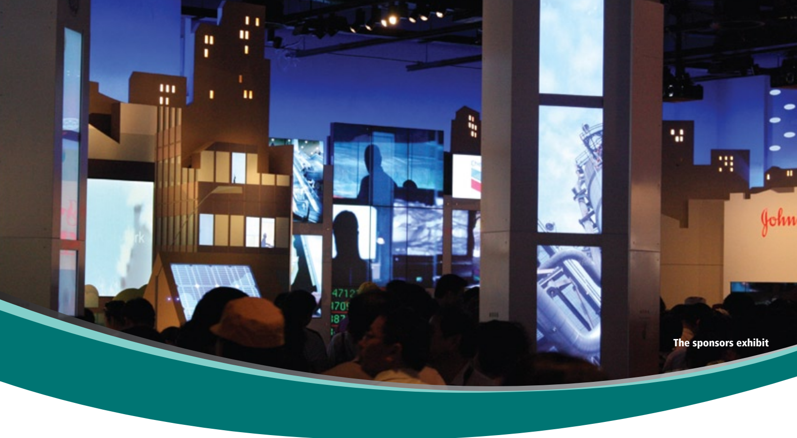
The sponsors exhibit

minutes. With no dialogue, the film's visuals, lighting and music combine to deliver the message of community to the visitors.